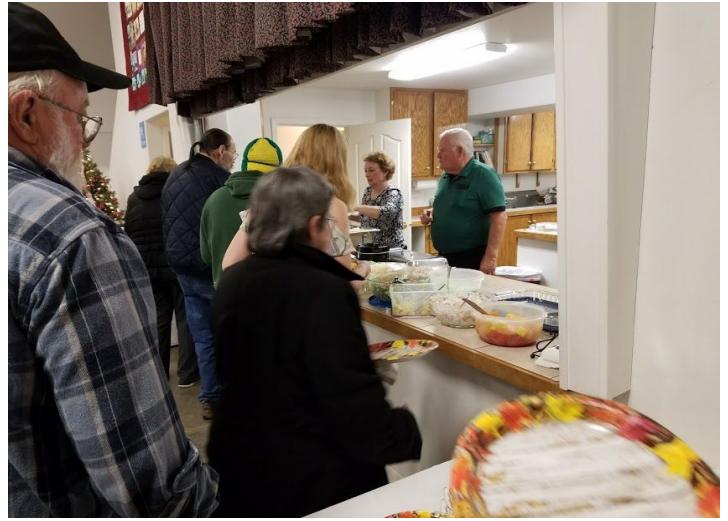
Better get yourself in line, or you're gonna miss out!