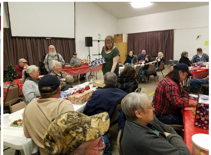
A Good ol' fashioned white elephant gift swap!