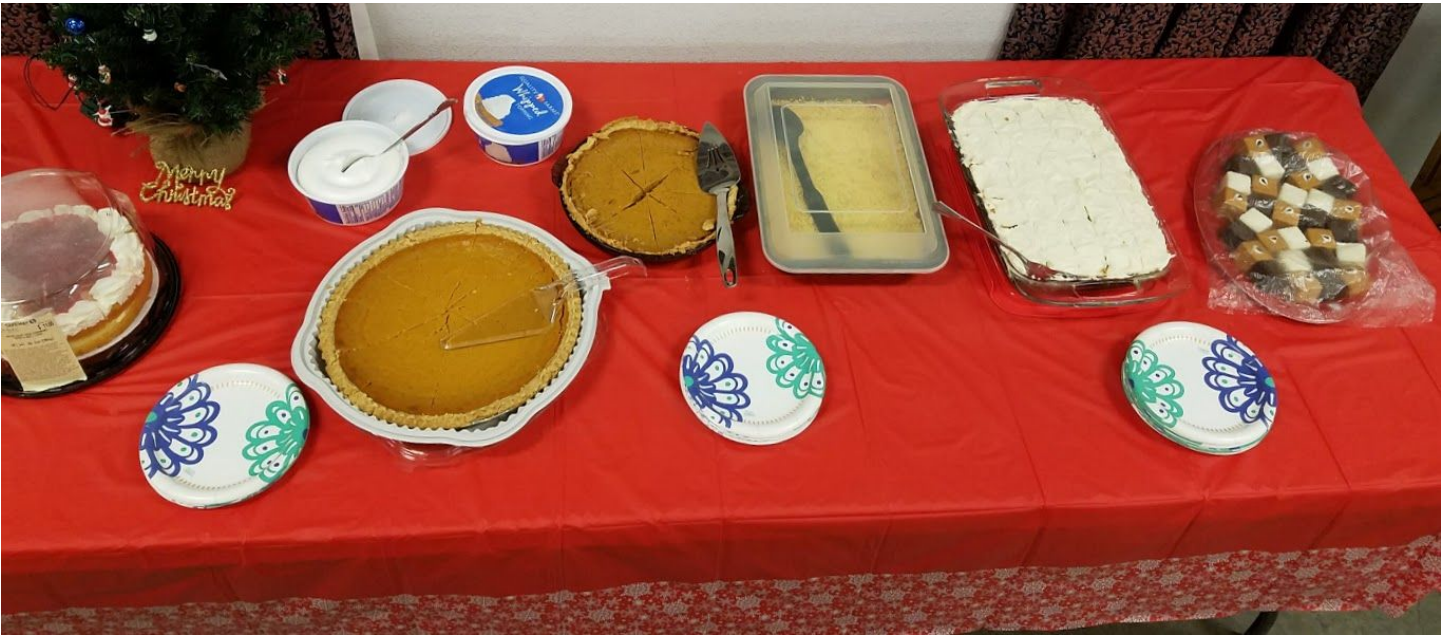
If you go away from here hungry, we're pretty sure you don't have anyone to blame but yourself!