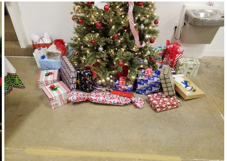
All kinds of white elephant gifts awaiting their new owners!