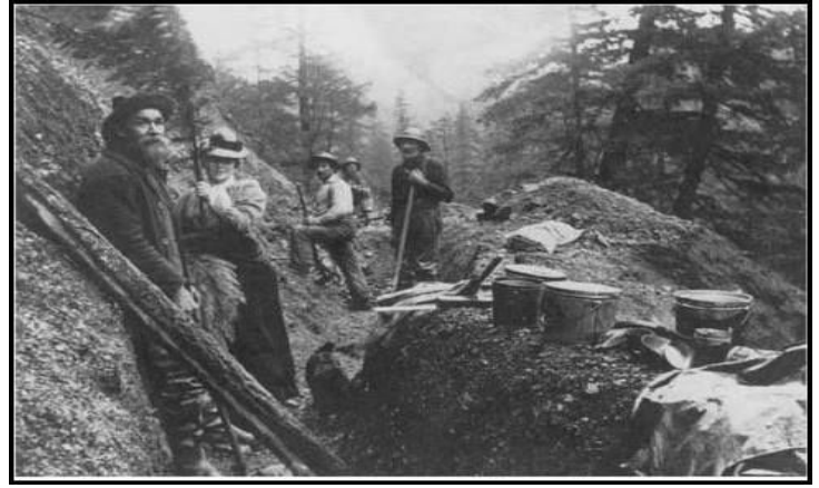
Dan Green (left) and crew digging ditch in Galice. These ditches were such marvels of basic engineering that nearly 120 years later, they are still 99% intact.