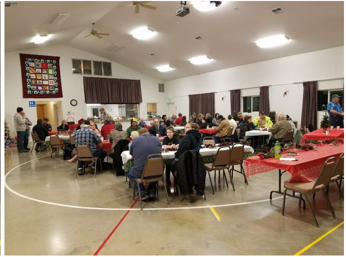
All of us gathered together...