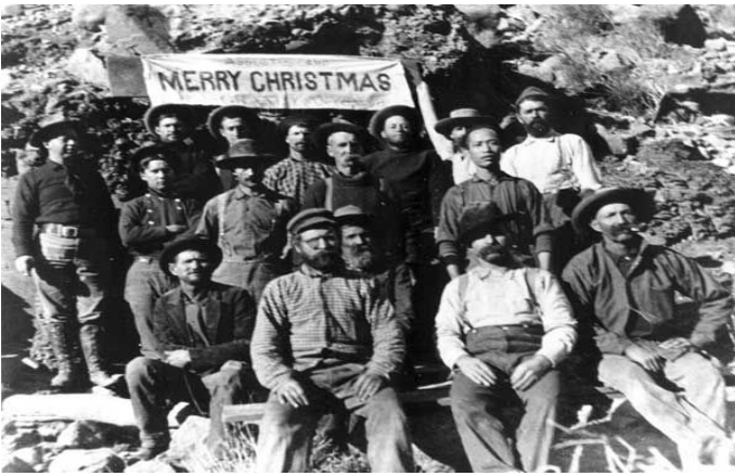
Even the old timers took the day off ...