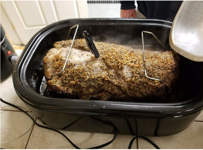
Gary Sturgill's Signature Prime Rib, steaming and ready to eat!