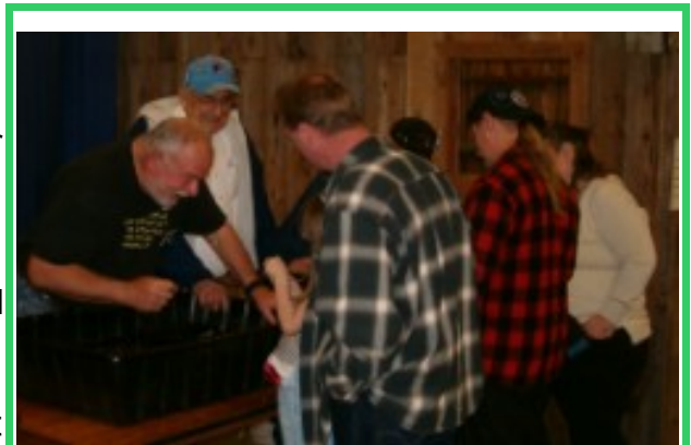
Gold Show volunteers

The hall has been reserved for next February, and we will have our first Gold Show meeting in July for anyone who would like to be involved in the planning process for next year. We will be working more on the advertising end of it next year, having more time for the planning of this event.