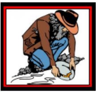
444 Winchester PMB 12-D, Roseburg, OR 97470